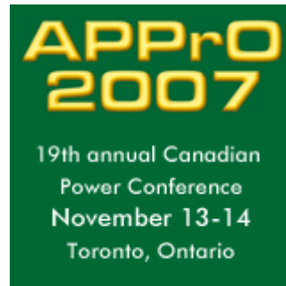
Button – under vertical right, (160x160)