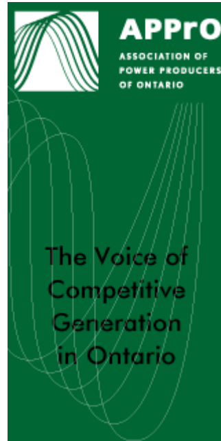
Skyscraper - vertical, left or right side (160x300 pixels)